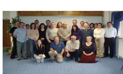
Dyfed-Powys Drug Interventions Programme Staff at a recent Training Day in Carmarthen.

PDAC offers a range of services including counselling, advocacy, support to the client and family, substitute prescribing and pathways into community and residential detox. Contact for clients to the DIP programme will be through Criminal Justice Workers in Police Stations, Courts, Prison Link Worker liaison, self referral and 24 hour Helpline.